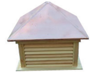
Vented Cupola with weather vane options

Finally, choose steel siding, roof and trim colors to complete your barn!